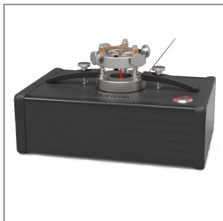
Diacell® Horizon with easyGlue